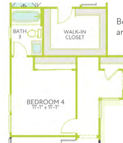
Bedroom 4 and Bath 3