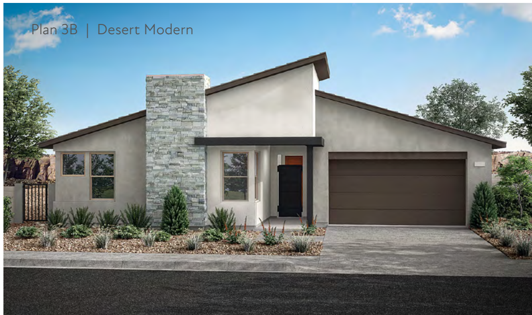
Plan 3B | Desert Modern