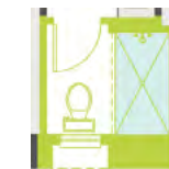
Bath 2 Shower