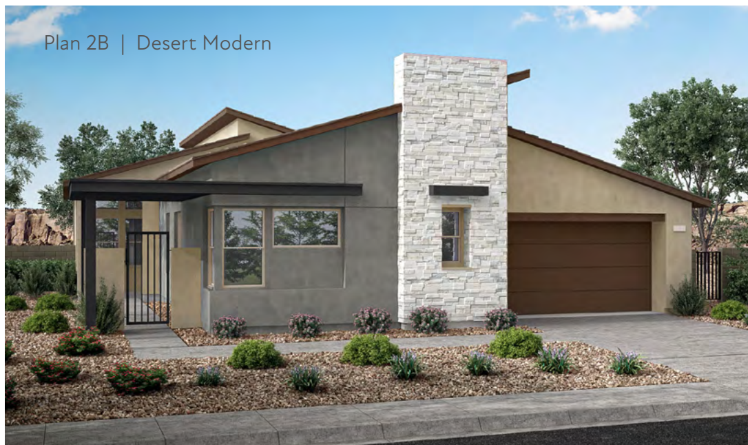
Plan 2B | Desert Modern